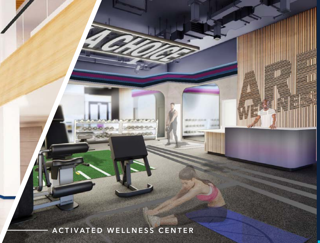
ACTIVATED WELLNESS CENTER