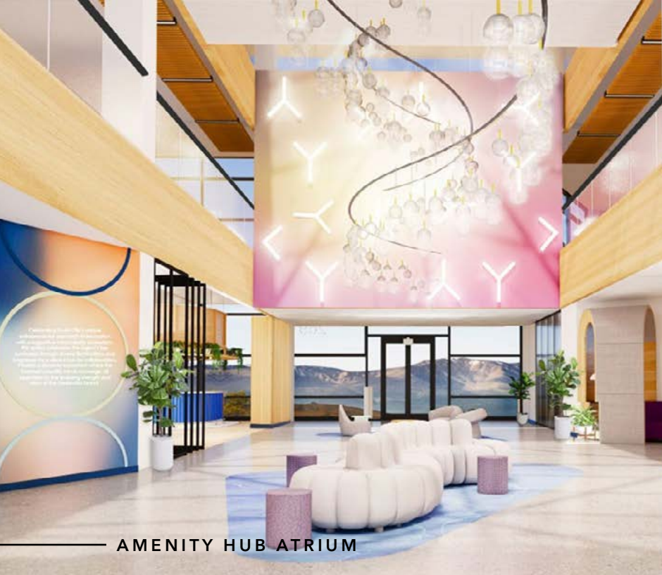
AMENITY HUB ATRIUM