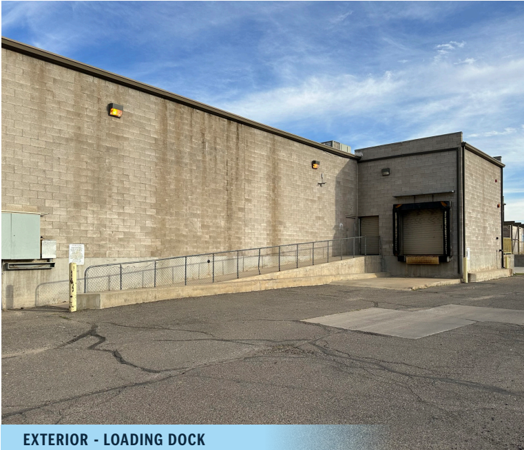
EXTERIOR - LOADING DOCK