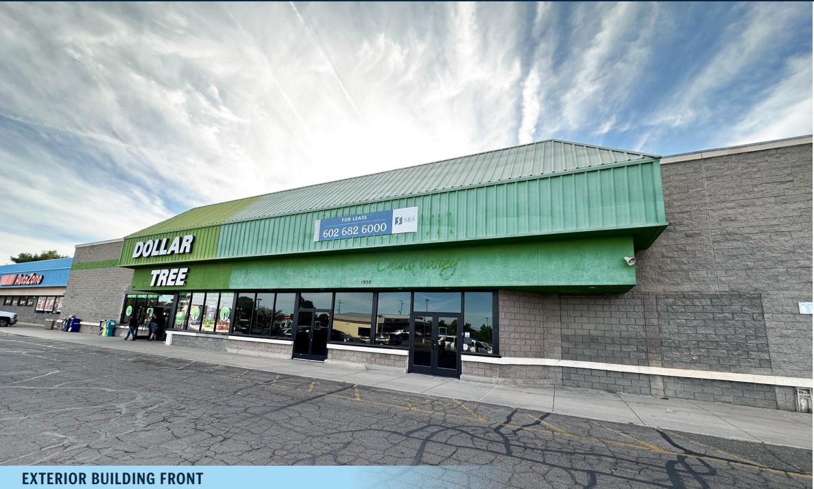
EXTERIOR BUILDING FRONT