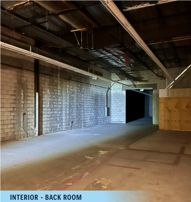
INTERIOR - BACK ROOM