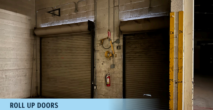
ROLL UP DOORS