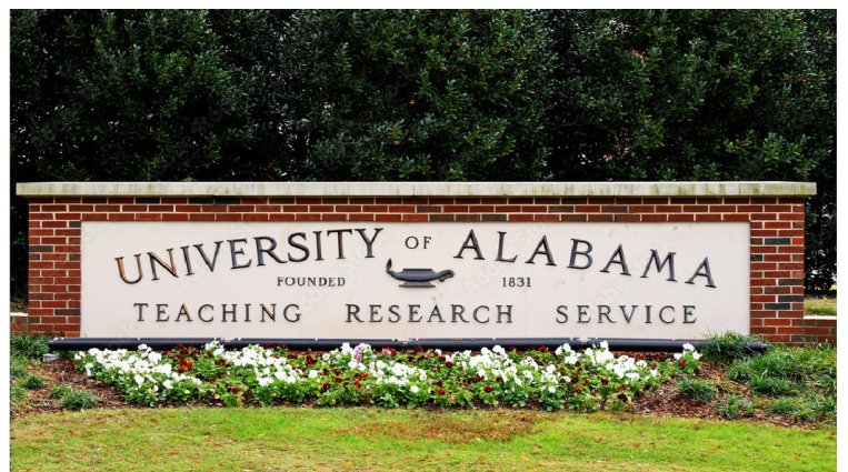
The University of Alabama

Tuscaloosa is the home of The University of Alabama, Stillman College, and Shelton State Community College. The University of Alabama currently enrolls over 38,000 students with a statewide impact of $2.7 billion. The University of Alabama remains the dominant economic and cultural engine in the city. Stillman College, a private historically Black liberal arts institution, is located on a 105-acre campus in Tuscaloosa. Shelton State is one of the largest community colleges in the state with approximately 7,000 students enrolled.