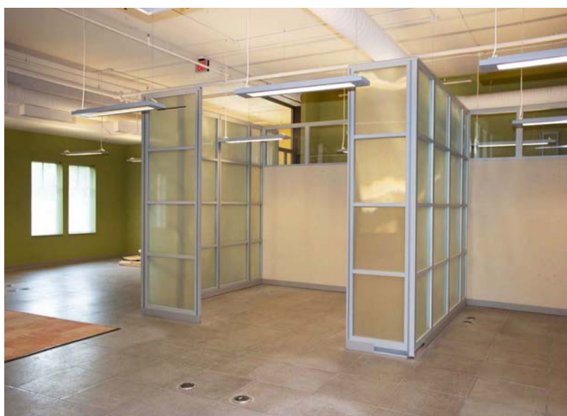
Suite 200 Photos