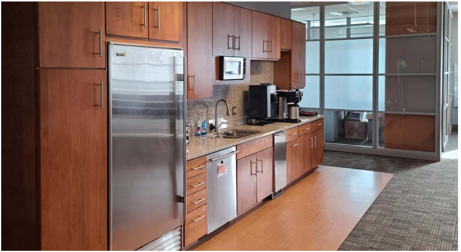
Suite 220 Photos