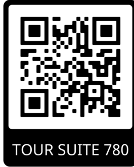
SUITE 780 1,627 RSF