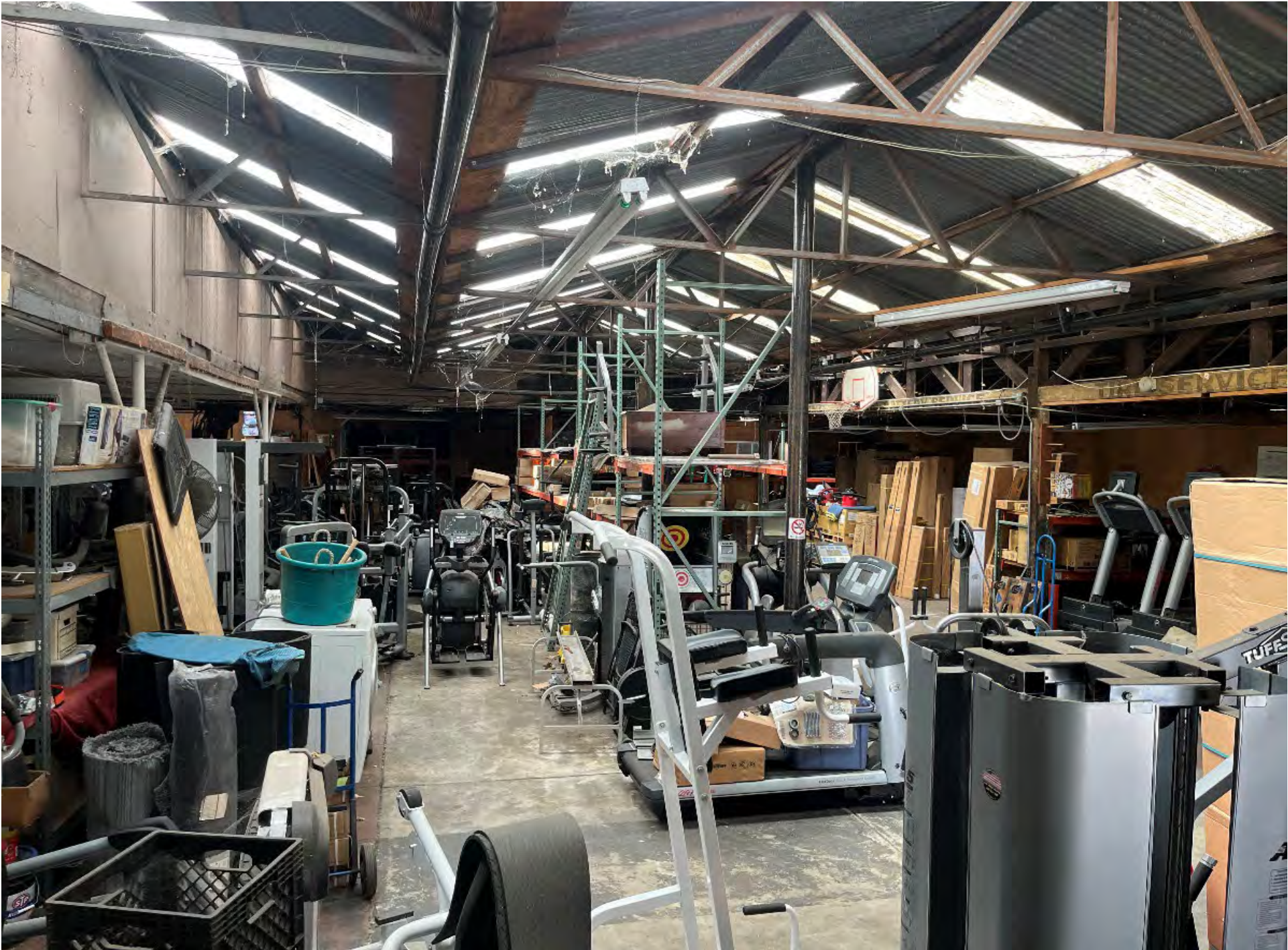
The Information contained herein has been obtained from sources we deem reliable. We cannot, however, assume responsibility for its accuracy.