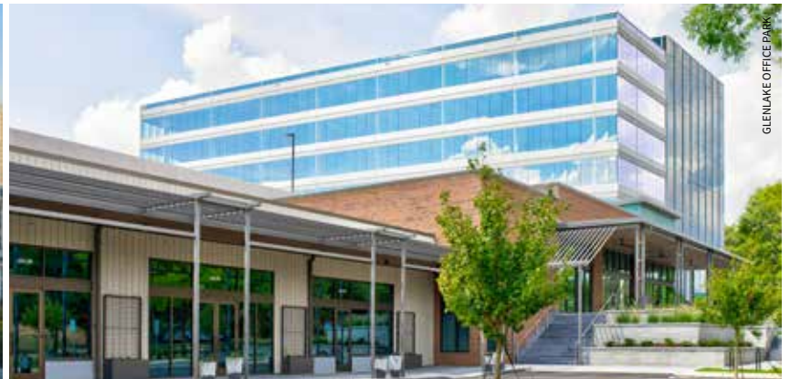
GLENLAKE OFFICE PARK