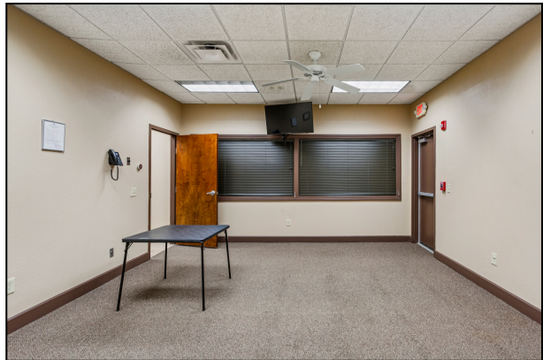
15' x 21' Social Hall with Exterior Entry.