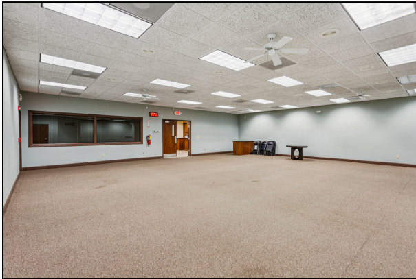
39' x 36' assembly hall.