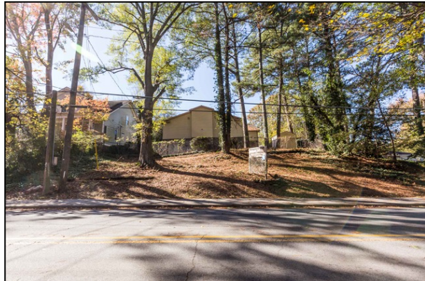
Defoor Ave - 98' frontage on Defoor Ave.