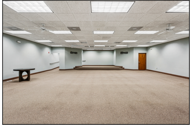
39' x 36' assembly hall with elevated dais.