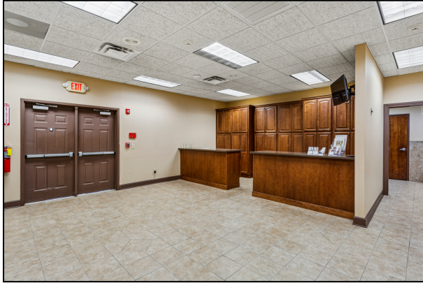
Large reception, waiting area with restrooms.