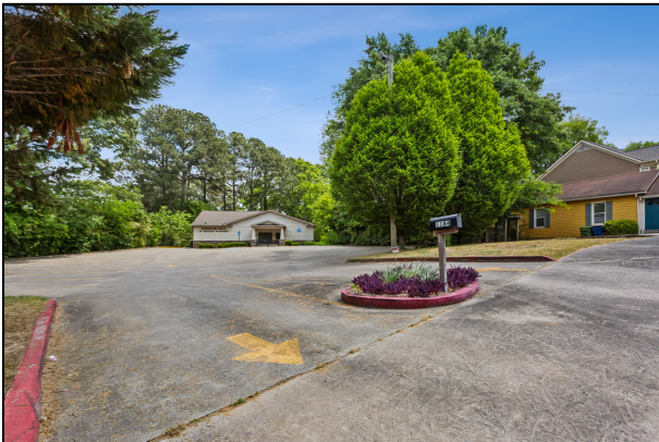
Davis Place - 87' frontage on Davis Place.