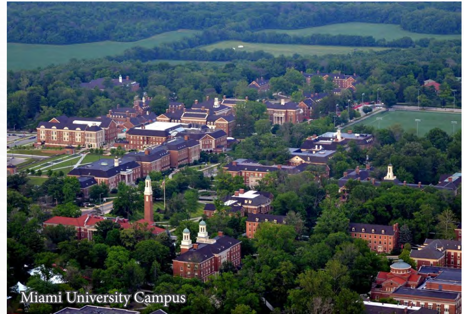
Miami University Campus

Miami University participates in 18 NCAA Division I sports in the Mid America Conference.