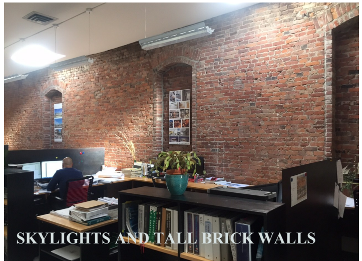
SKYLIGHTS AND TALL BRICK WALLS