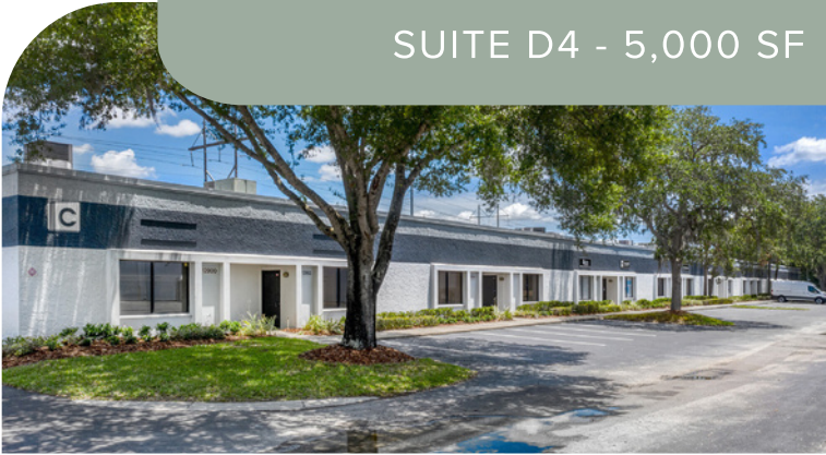
SUITE D4 - 5,000 SF

11812-11814 RACE TRACK RD, I TAMPA, FL 33626 SUITE D4