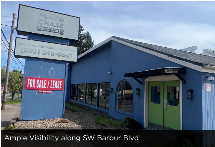
Ample Visibility along SW Barbur Blvd