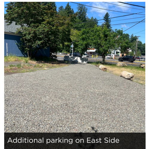
Additional parking on East Side