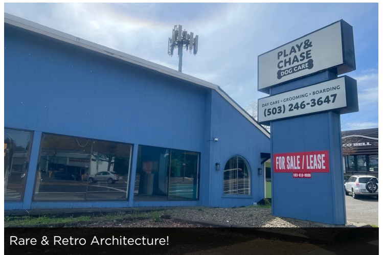
Rare & Retro Architecture!