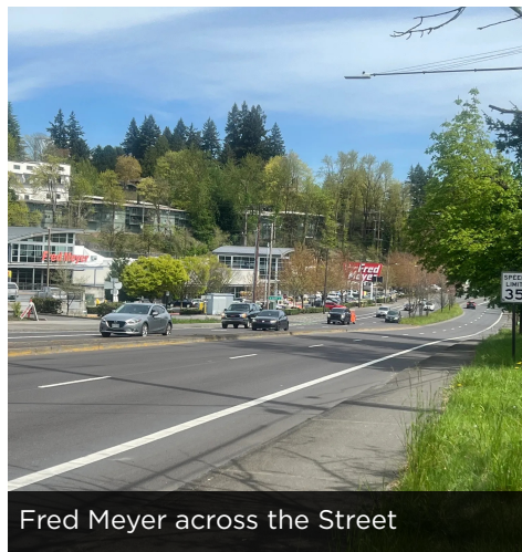
Fred Meyer across the Street