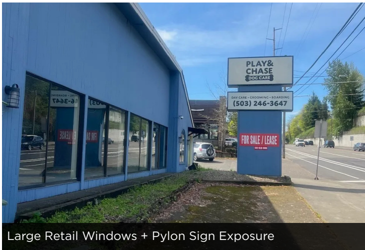
Large Retail Windows + Pylon Sign Exposure