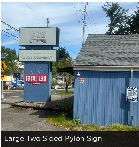
Large Two Sided Pylon Sign