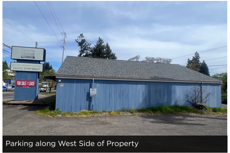
Parking along West Side of Property