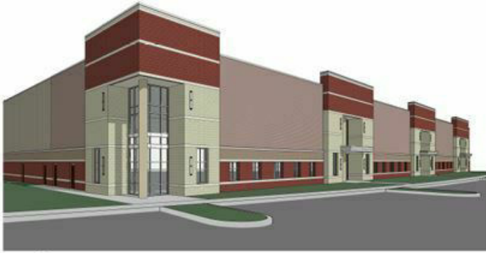
1 3D View 2 (close up corner)