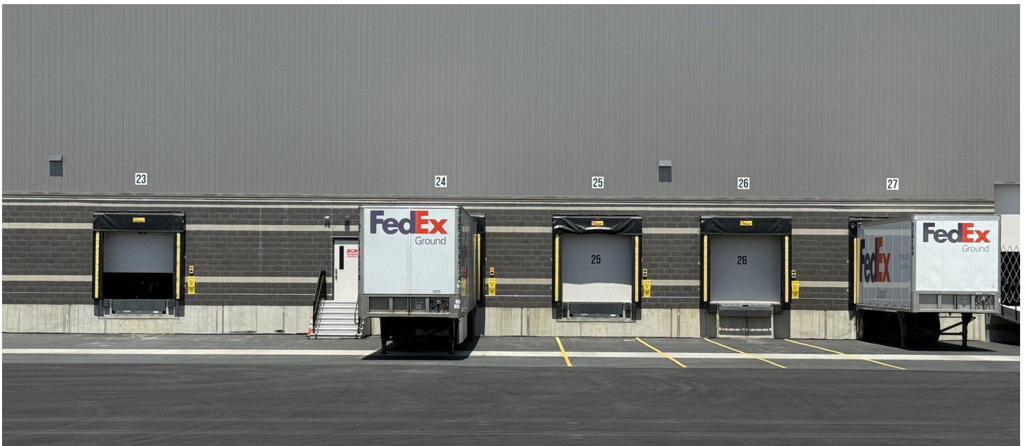
Reference image of an existing industrial building recently developed by the landlord, reflecting similar architectural features to the proposed design.