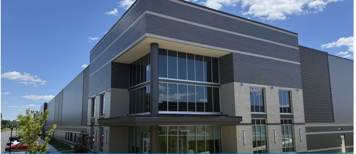
Reference image of an existing industrial building recently developed by the landlord, reflecting similar architectural features to the proposed design.