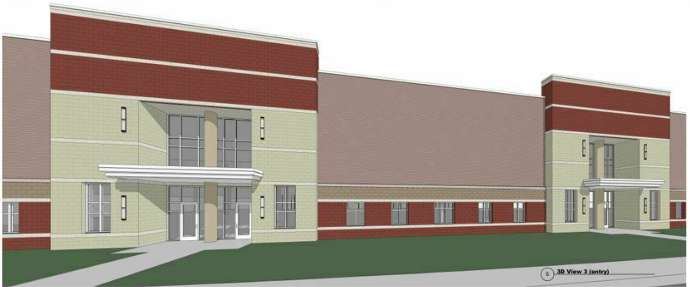
3 3D View 3 (entry)