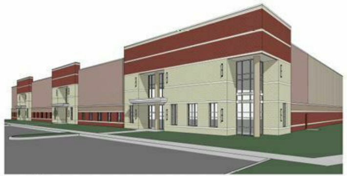
2 3D View 1 (close up corner)