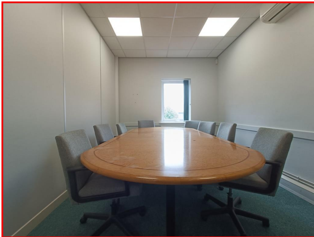
Internal views of the First Floor, Unit 2