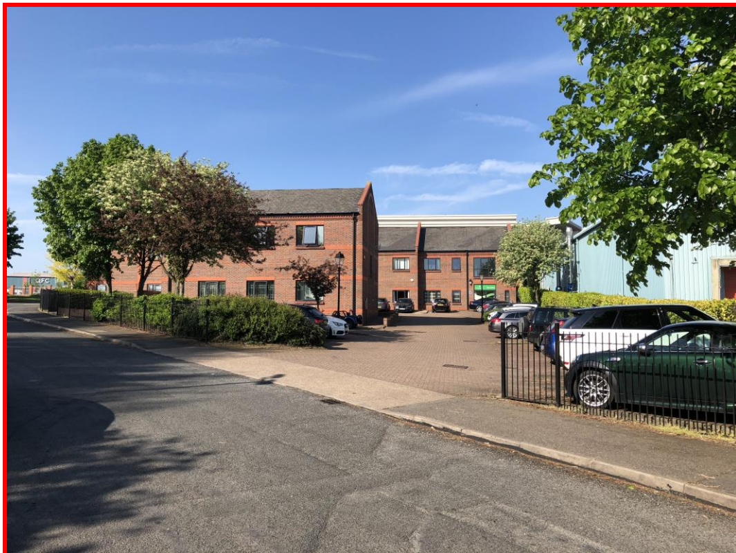
View of the units at Hill Court from Turnpike Close