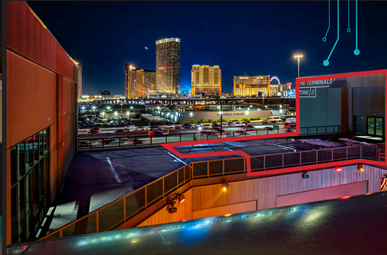
VIEW FROM SECOND FLOOR BALCONY