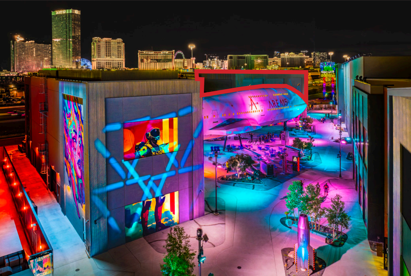
VIEW FROM 747 EXPERIENCE PLAZA