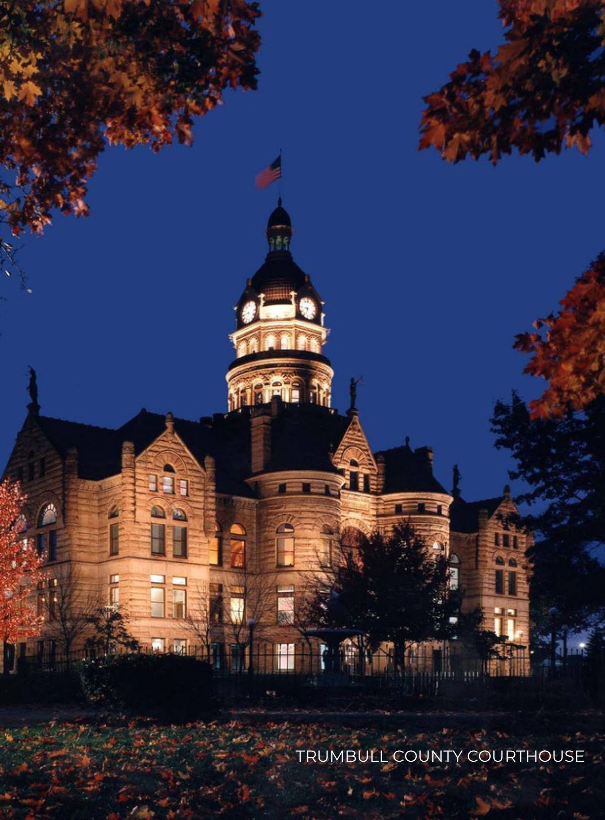
TRUMBULL COUNTY COURTHOUSE

Mesopotamia Township is one of the twenty-four townships of Trumbull County, Ohio with a population of 3,012 in 2025. Trumbull County is a part of the Youngstown-Warren-Broadman, OH-PA Metropolitan Statistical Area with a population of 423,678 in 2025. This area also has a strong commuter interchange with Cleveland and Pittsburgh and their metropolitan areas. It is located at the great manufacturing center of the United States, which stretches from Minneapolis in the west to Johnstown and Altoona in the east.