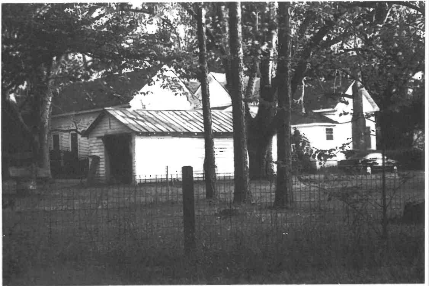
CHAIRES COMMUNITY H.D., LEON CO, FL # 6