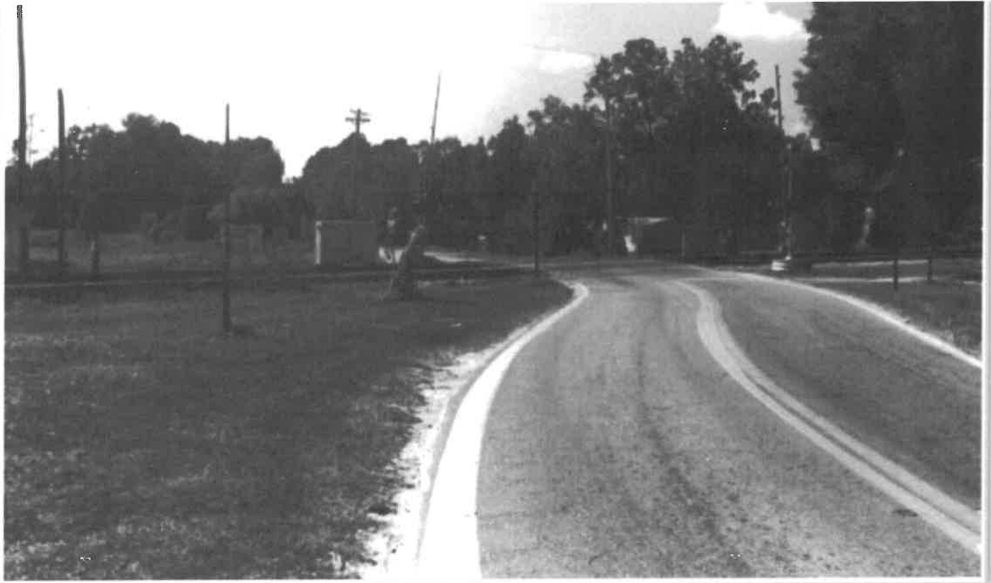
CHAIR'S COMMUNITY U.D., LEON CO, FL