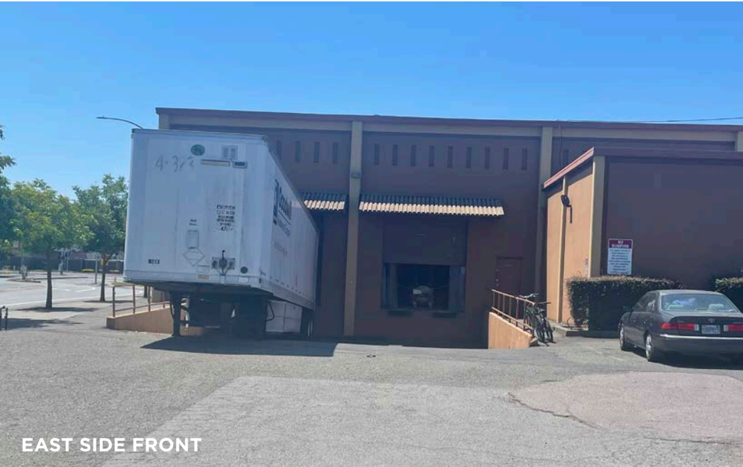
EAST SIDE FRONT