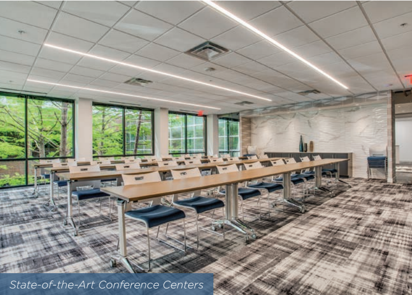
State-of-the-Art Conference Centers