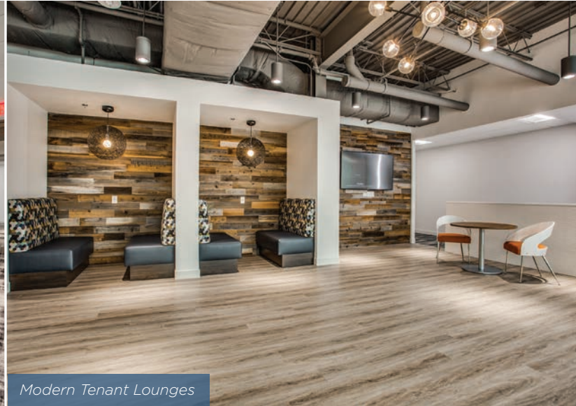
Modern Tenant Lounges