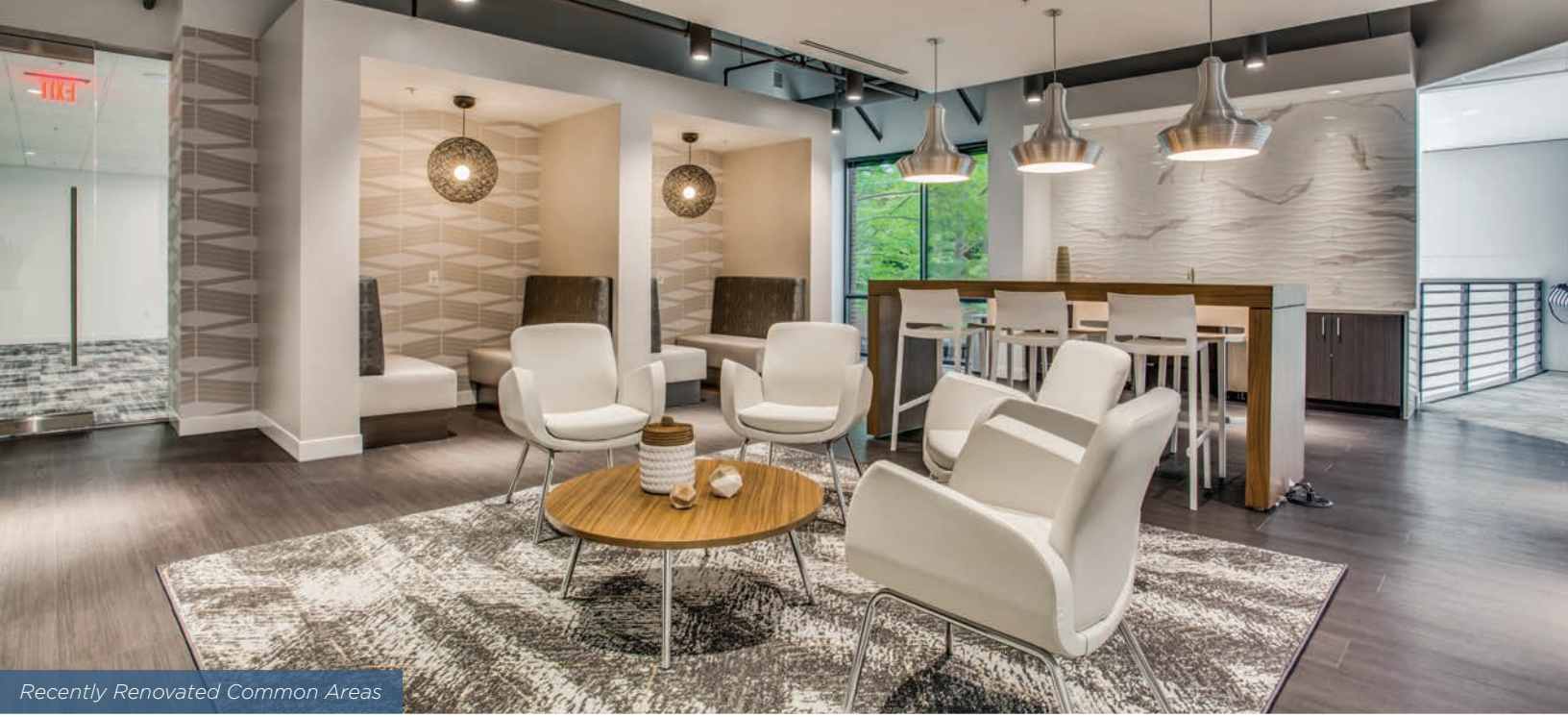
Recently Renovated Common Areas