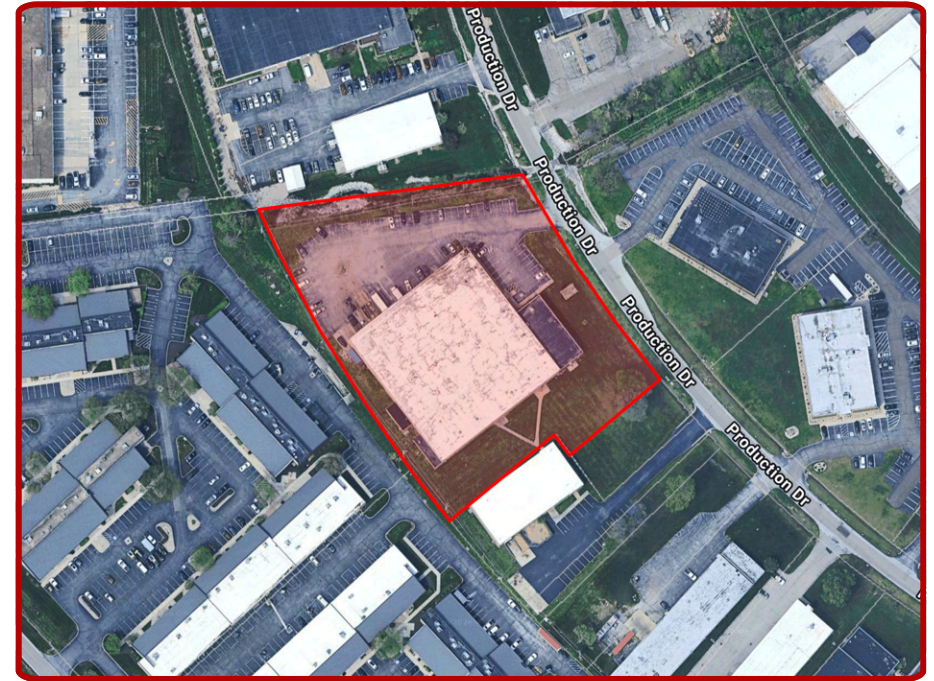
Aerial View with Property Boundary