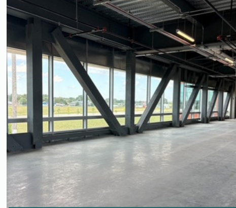
MODERN INDUSTRIAL DESIGN