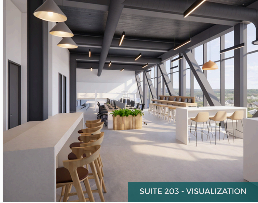
SUITE 203 - VISUALIZATION