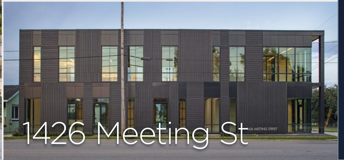
1426 Meeting St