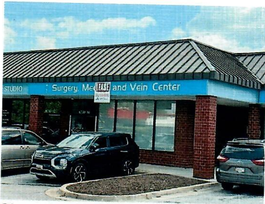
Glass storefront & Signage