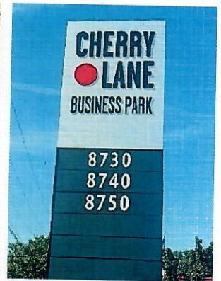
Business Park Sign