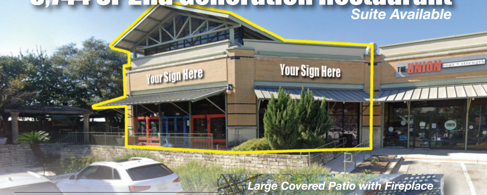
Large Covered Patio with Fireplace