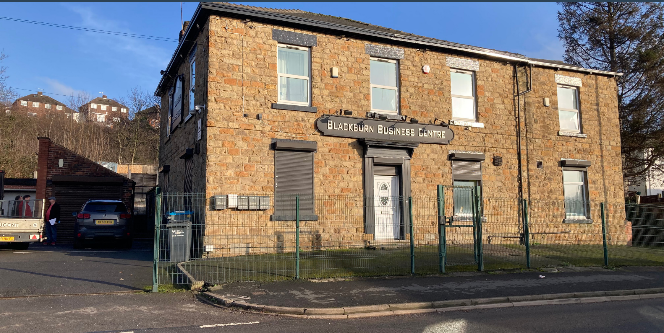
Blackburn Business Centre, Blackburn Road, Rotherham S61 2DW