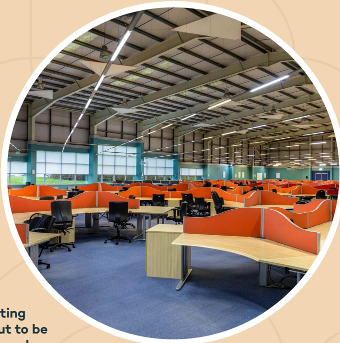
Existing fitout to be removed

Plans of the building are available on request.