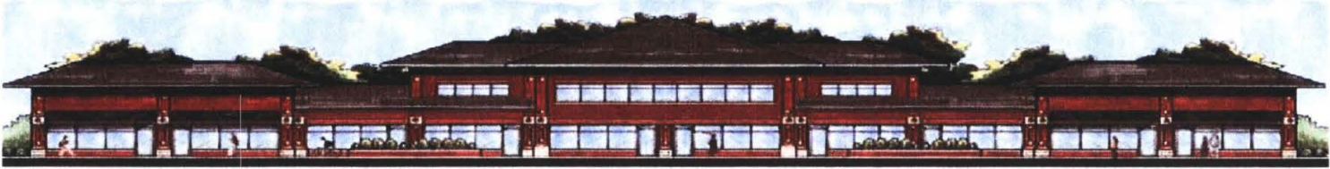
Naperville South Commons