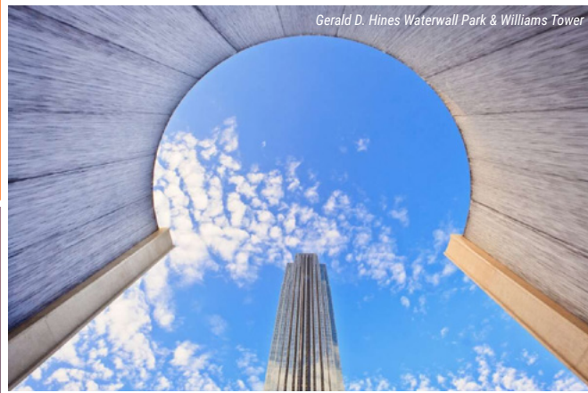
Gerald D. Hines Waterwall Park & Williams Tower

The metropolitan area is also known internationally for its medical community and is home to Texas Medical Center , the largest of its kind in the world.