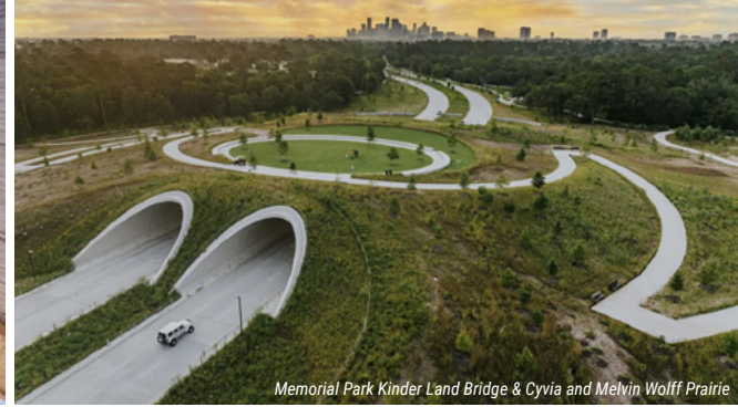
Memorial Park Kinder Land Bridge & Cyvia and Melvin Wolff Prairie

Quality of Life: The metropolitan area's favorable location and climate translate to an abundance of outdoor activities. More than a dozen state parks and recreation areas lie within a short drive of Houston's city limits, as well as more than 500 local parks and open spaces, various cultural venues and museums.