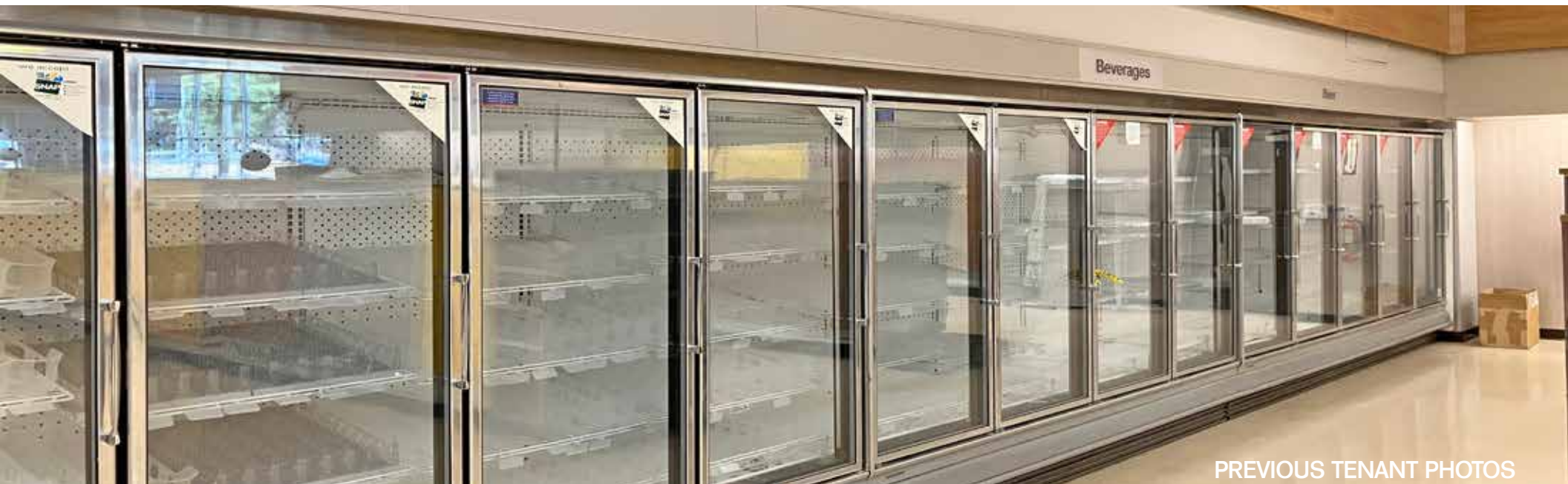
PREVIOUS TENANT PHOTOS