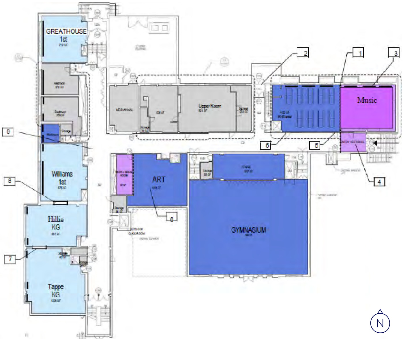
Lower Campus Ground Floor