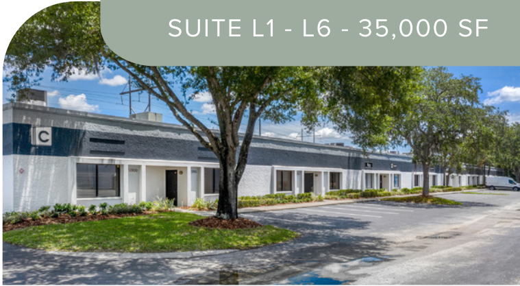
SUITE L1 - L6 - 35,000 SF

14100 - 14170 MCCORMICK DRIVE, TAMPA, FL 33626 SUITE L1 - L6