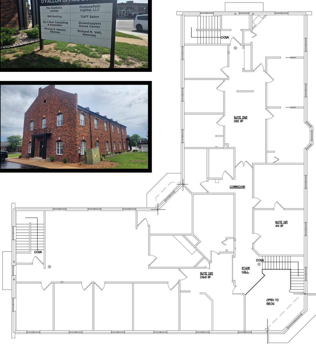
SECOND FLOOR PLAN SCALE: 1/8" = 1'-0"