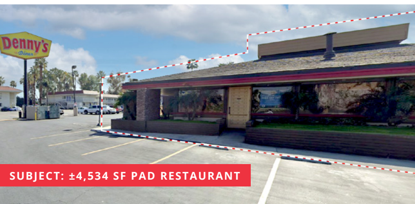
SUBJECT: ±4,534 SF PAD RESTAURANT