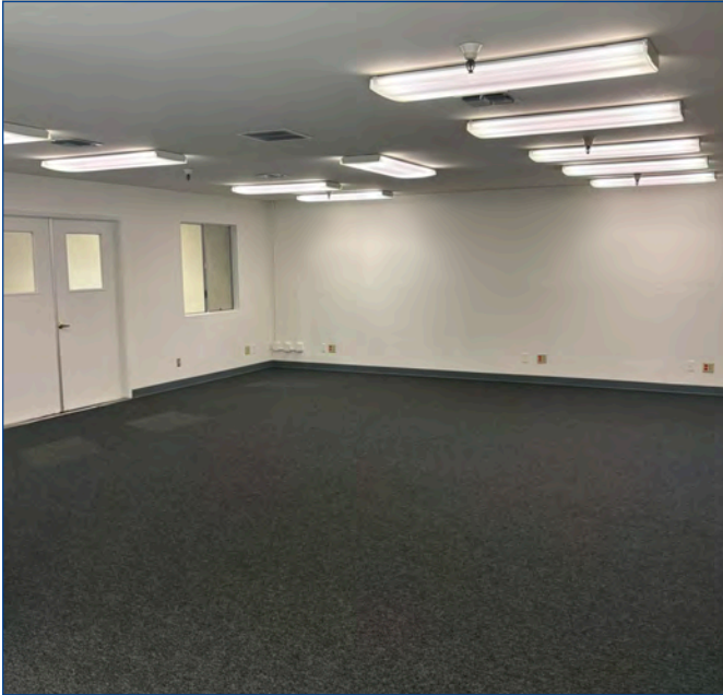
1122 S. WILSON WAY