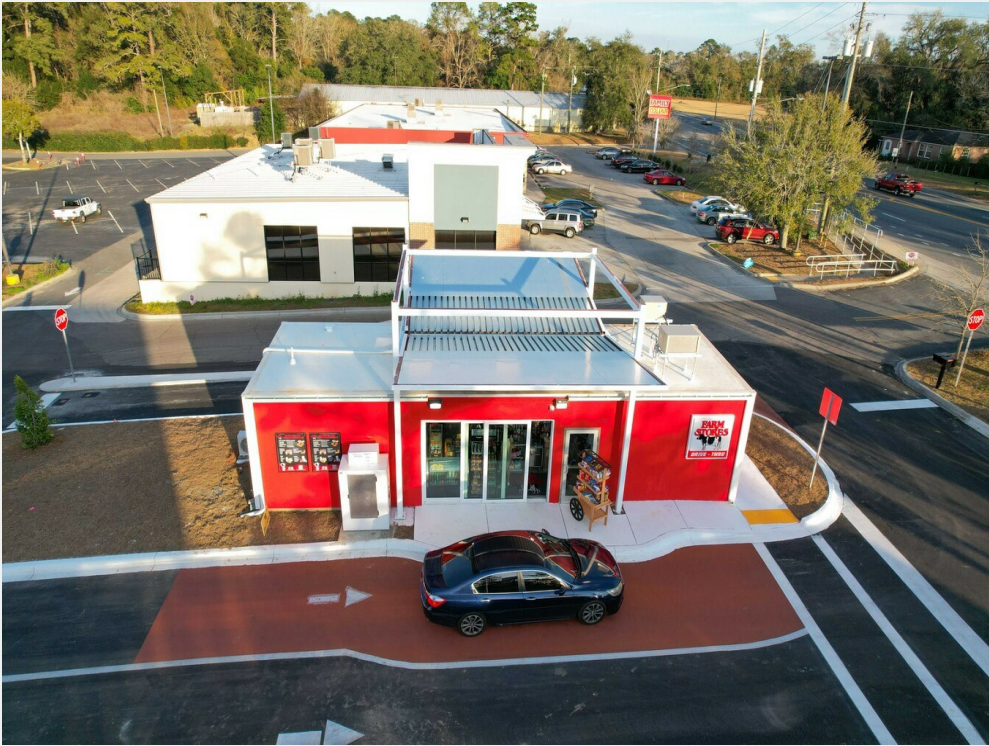
Farm Stores (1)