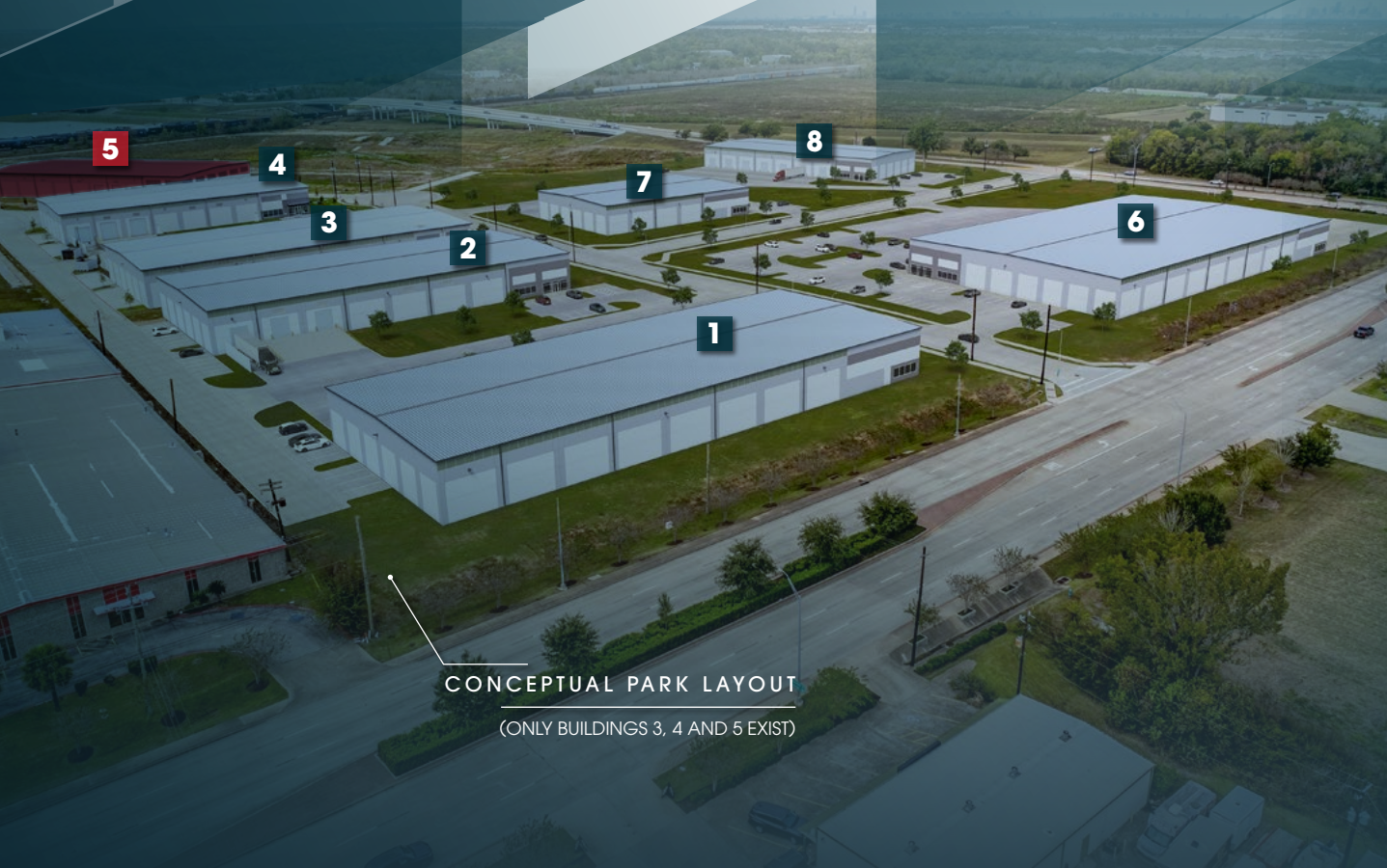
CONCEPTUAL PARK LAYOUT