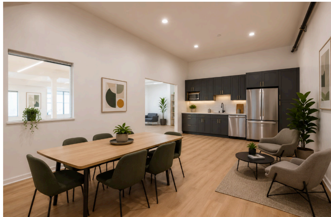
AI Generated Furniture