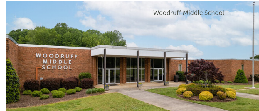
Woodruff Middle School