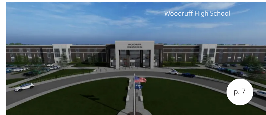
Woodruff High School