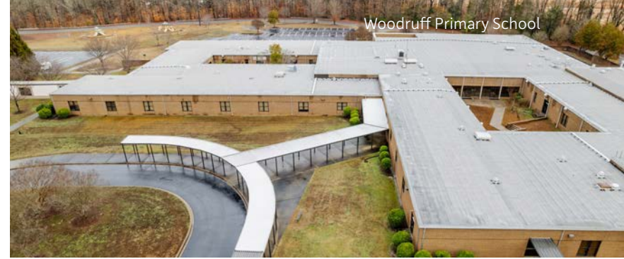
Woodruff Primary School

This property is located less than one mile from all four schools in this district.