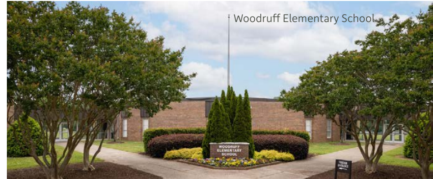
Woodruff Elementary School