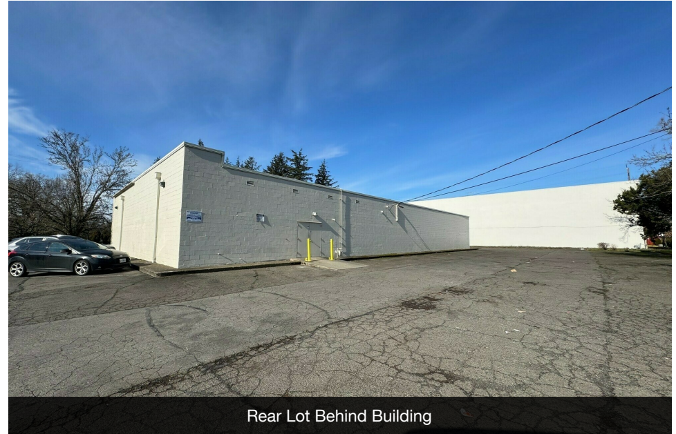
Rear Lot Behind Building