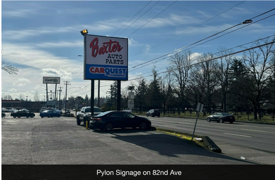
Pylon Signage on 82nd Ave