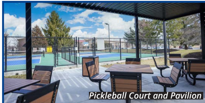
Pickleball Court and Pavilion