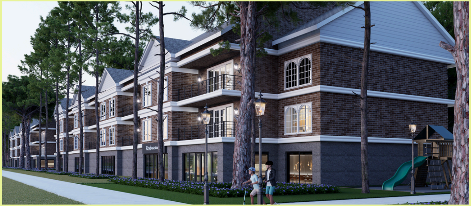
FRONT VIEW - MIXED-USE CONCEPT RENDERING