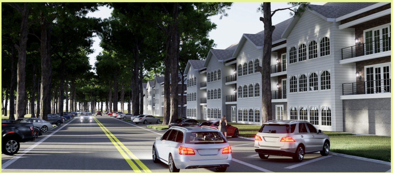
REAR VIEW - MIXED-USE CONCEPT RENDERING

Phil Griffin 904.556.9140 phil@acrfl.com