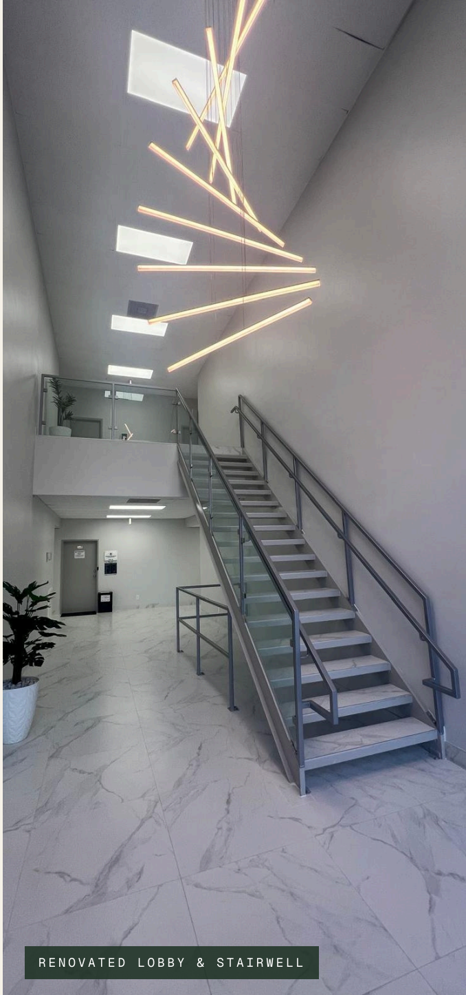
RENOVATED LOBBY & STAIRWELL

Renovated common areas across the campus: marble countertops, porcelain tile, and updated lighting. Suites are delivered to tenant-specified build-out.