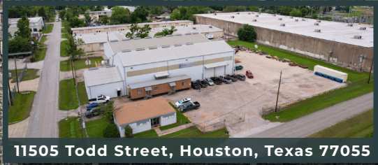
11505 Todd Street, Houston, Texas 77055