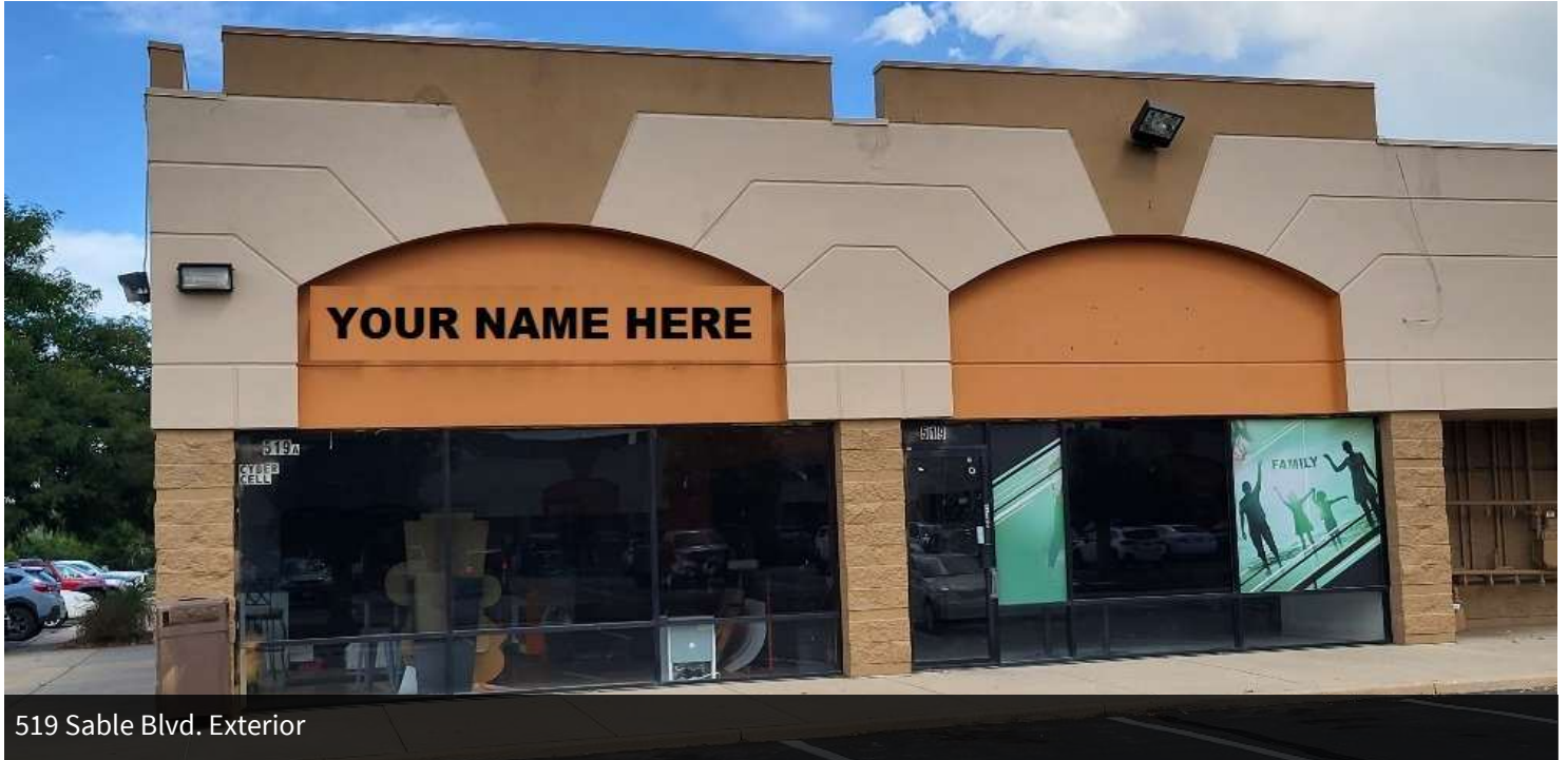
519 Sable Blvd. Exterior