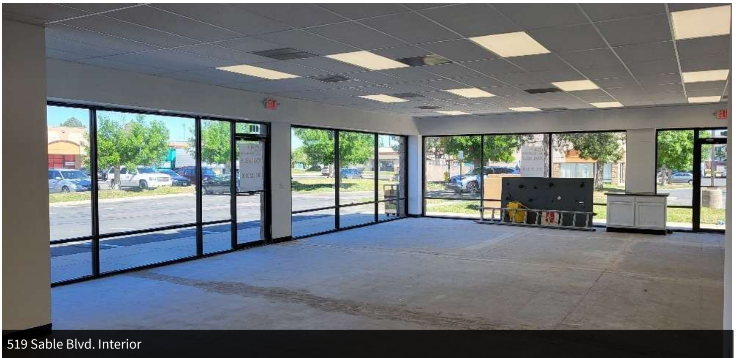
519 Sable Blvd. Interior