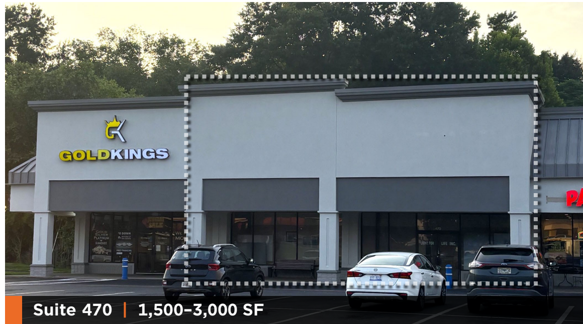
Suite 470 | 1,500-3,000 SF