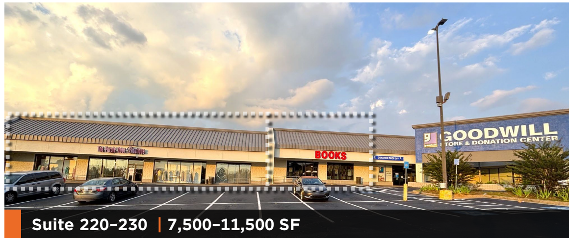
Suite 220-230 | 7,500-11,500 SF