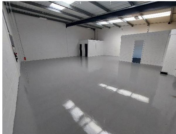
The internal photographs are of another unit on the estate which has been recently refurbished. The subject unit will be refurbished to a similar standard.