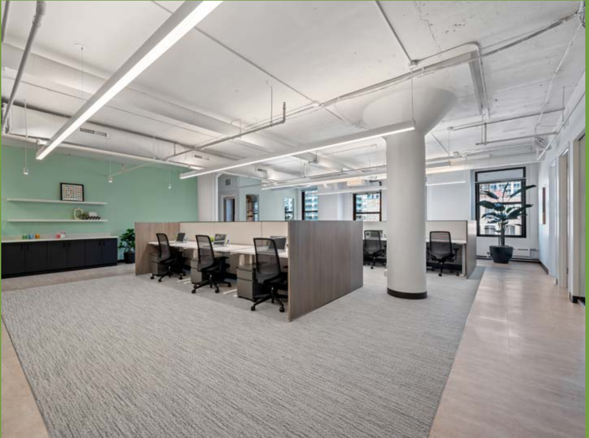
Photos taken from a similar space in the building