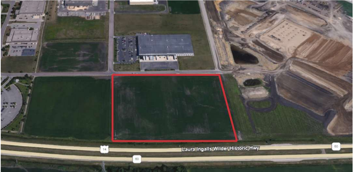
PARCEL WEST OF WALMART DISTRIBUTION EXPANSION PROJECT