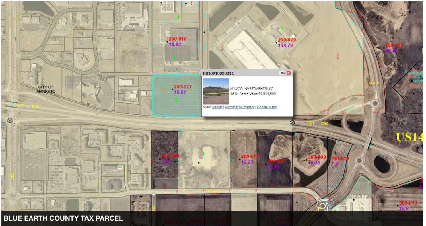
BLUE EARTH COUNTY TAX PARCEL