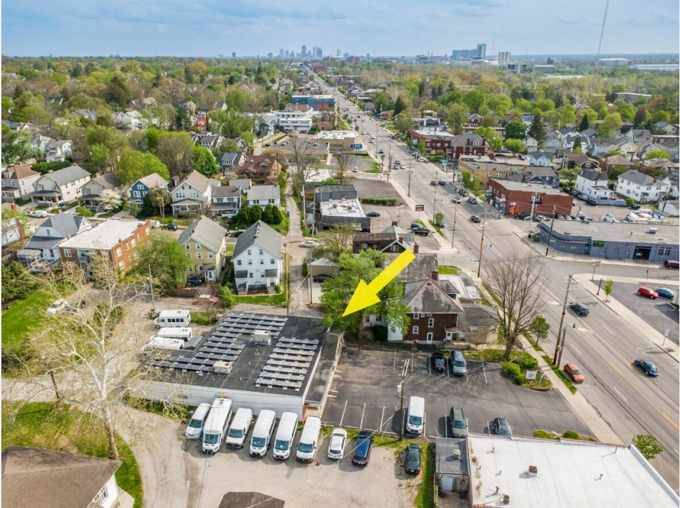
023_df_i 3222 N High 038-Edit