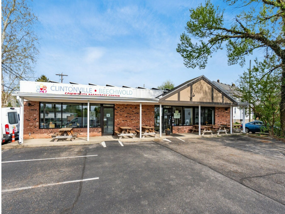
003_f7024ad_i 3222 N High 034