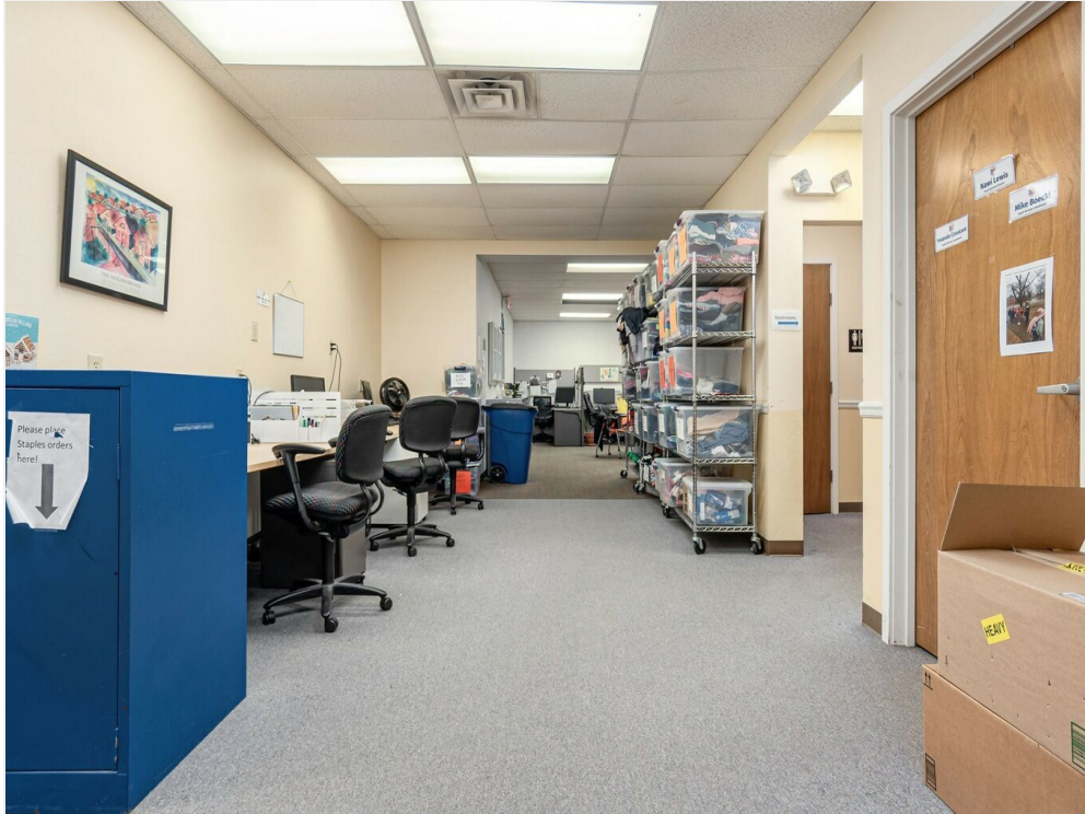
007_64e0fe4_i 3222 N High 011