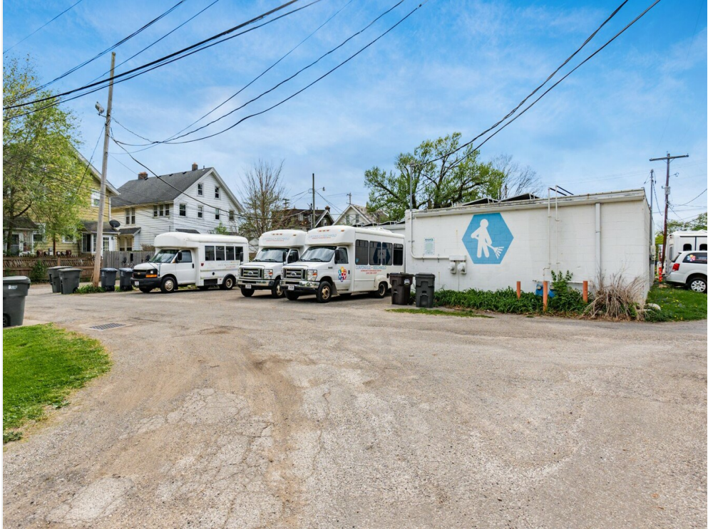
009_9c201f7_i 3222 N High 015