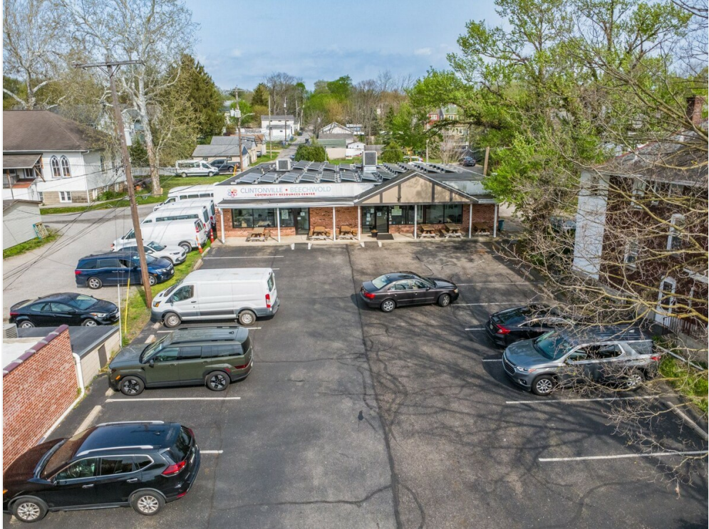
027_48ccca5_i 3222 N High 040