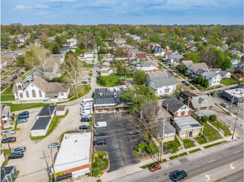
022_a5ca081_i 3222 N High 037