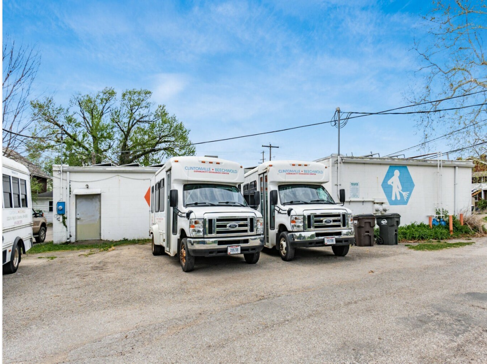
010_361add8_i 3222 N High 016