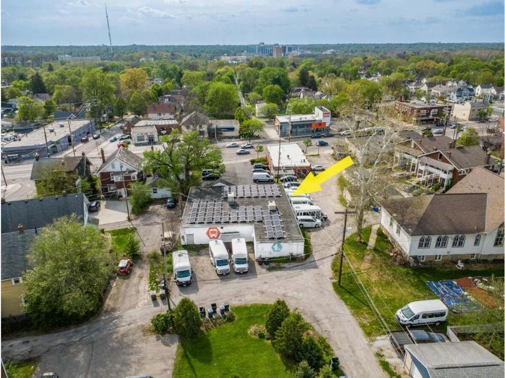
025_4e_i 3222 N High 039-Edit