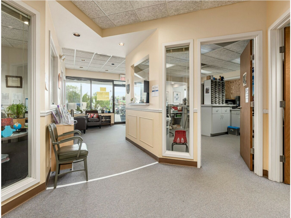
006_8ab0524_i 3222 N High 007