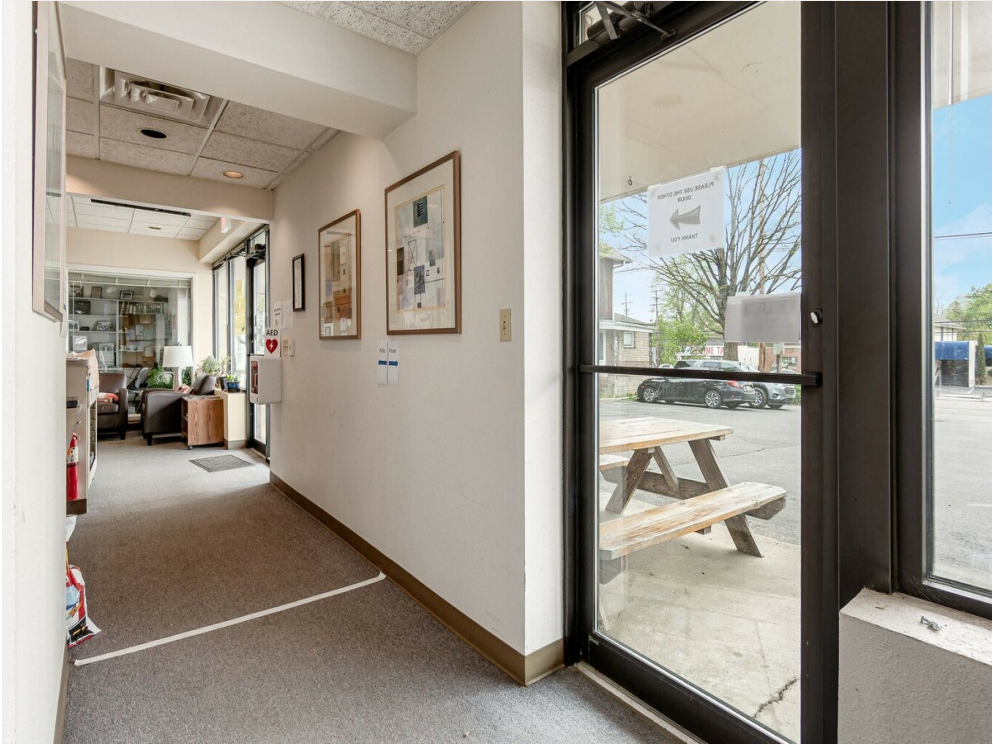
013_2eabed4_i 3222 N High 021