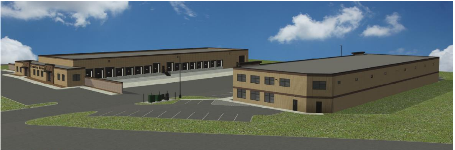
PERSPECTIVE ELEVATION NOT TO SCALE